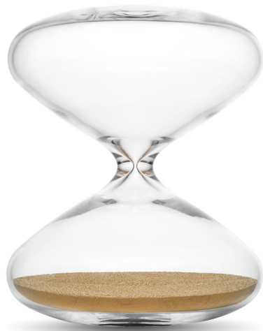
The Hourglass — Marc Newson 2015 Switzerland Borosilicate glass, gold-plated stainless steel nanoballs © Philippe Joner