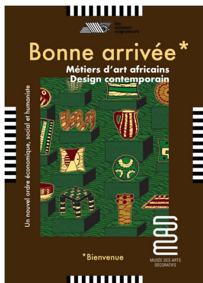
Poster of the exhibition — © Maison Chateau Rouge