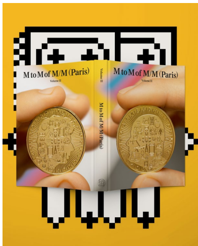
M to M of M/M (Paris), Volume 2 — Thames & Hudson edition © Thames & Hudson