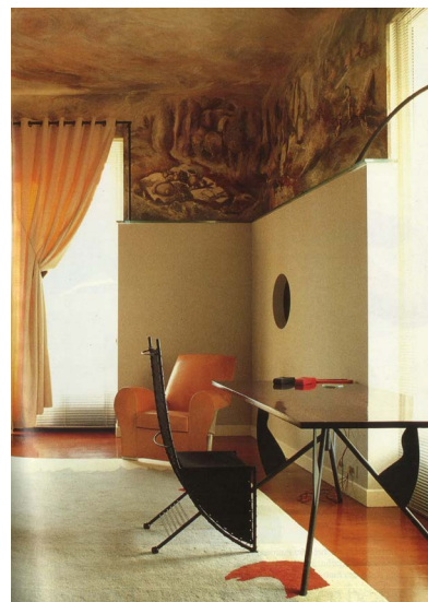
Frieze by Gérard Garouste and furniture ( Richard III club chair, Madame chair, Président M. table ) by Philippe Starck for Danielle Mitterrand's bedroom in the Elysée — 1982

The exhibition Années 80. Mode, Design & Graphisme en France , presented by the Musée des Arts Décoratifs, reflects this merging of ideas and forms in the fields of design, fashion and advertising.