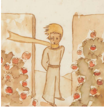
“A garden of roses in full bloom” — Illustration for chapter 20 Probably 1943 Watercolor and pencil on paper Stiftung für Kunst, Kultur und Geschichte, Winterthur © Coll. Succession Saint Exupéry–d’Agay