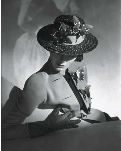
Horst P Horst — Vogue USA 15 March 1937