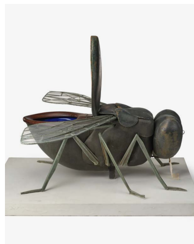
François-Xavier Lalanne — Fly 1966-1967 Brass, steel, porcelain, perspex and rosewood

Following an exceptional donation received in 2021, the Musée des Arts Décoratifs is honored to welcome into its collections 16 major works and 38 drawings by the French husband-and-wife artist team Claude and François-Xavier Lalanne. To celebrate this special event, the exhibition Histoires naturelles. Dation François-Xavier et Claude Lalanne au Musée des Arts Décoratifs is being held in the museum's nave from April 14 th to May 29 th , 2022. Presented alongside a selection of iconic pieces from the museum collection, the exhibition visits 50 years of creation from 1960 to 2010. One of the first institutions in France to give them meaningful exposure and recognition, particularly through the major retrospective Les Lalanne in 2010, the Musée des Arts Décoratifs is delighted to pay them homage once again.